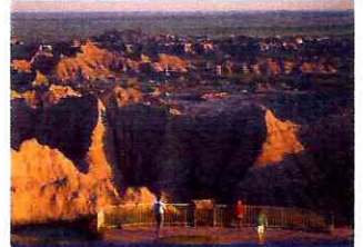
Spectacular Badlands National Park