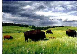
Wildlife enhances the pristine Black Hills