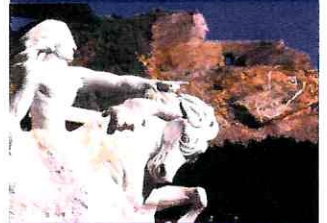
Crazy Horse Monument to be 10x the size of Mt. Rushmore